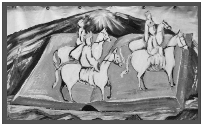
_____ Is the Church's Most Outstanding Feature

"In the Old Testament, the New is hidden; in the New Testament, the Old lies open."