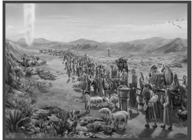
_____ Gives Guidance