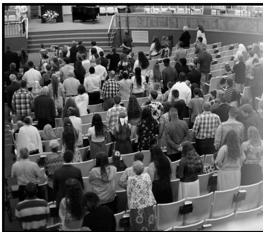
_____ Is in the Midst