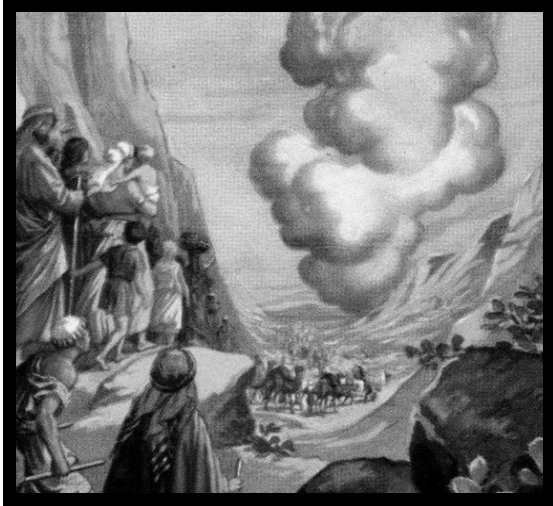
_____ Provides Defense