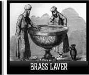
(1) Forgiveness of sins that are past