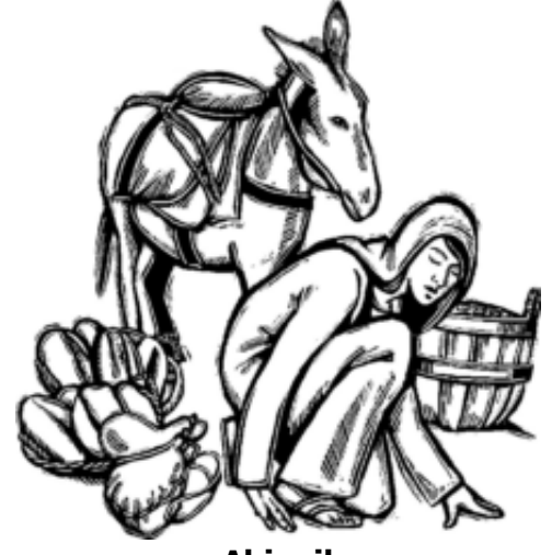
Abigail 1 Samuel 25:3