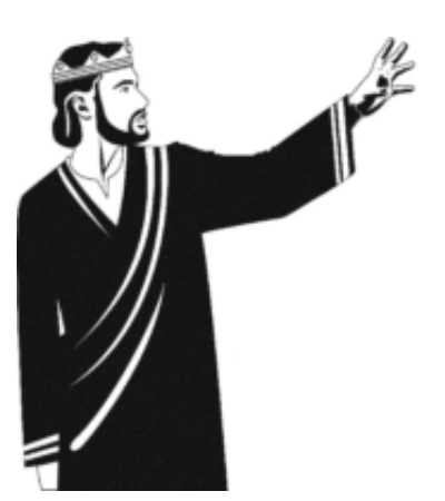
Solomon 1 Kings 3:9