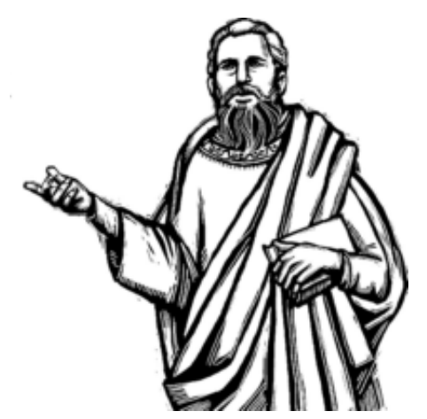
Paul Acts 16:18