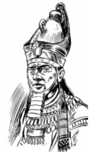
Pharaoh Exodus 5:2