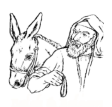
Balaam Numbers, Chapter 22