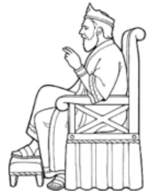
KING OF SYR _ _ A