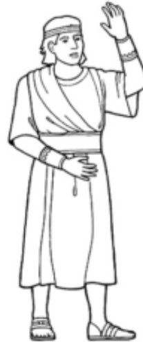
G _ _ HAZI