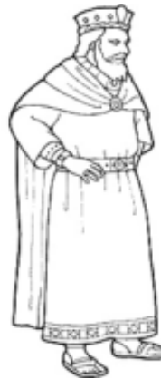
KING OF IS _ _ AEL