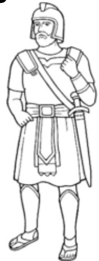
NAA _ _ AN