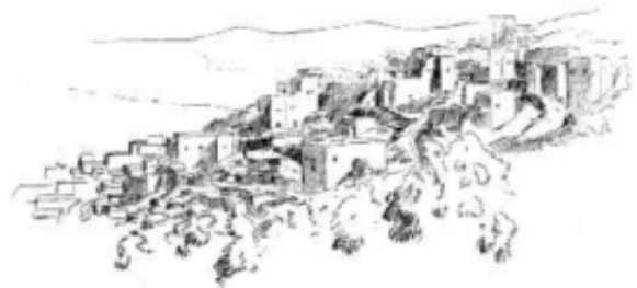
City of Emmaus