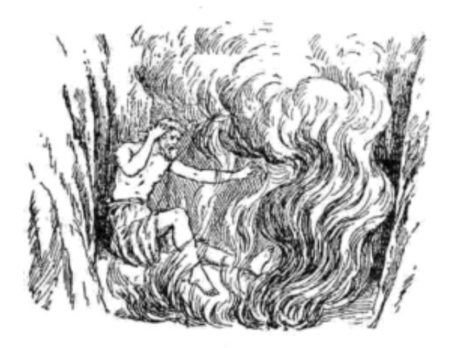
The rich man is tormented in _____.