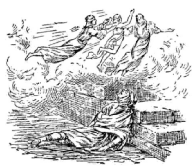
Lazarus died and was carried away by