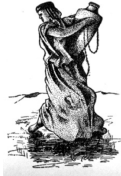
Lot's wife chose to look _____