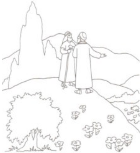
Lot chose the well-watered plains of _____