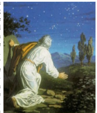
Abraham: Father of Many Nations

When Abraham and Sarah were living in the plains of Mamre ( MAM-ree ), the Lord came to visit Abraham in the form of three men. Abraham had a meal prepared for them. After eating, the men asked where Sarah was. Abraham said she was in the tent. Abraham was told, again, that Sarah