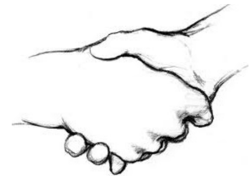
mark in their right hand (right hand of fellowship)