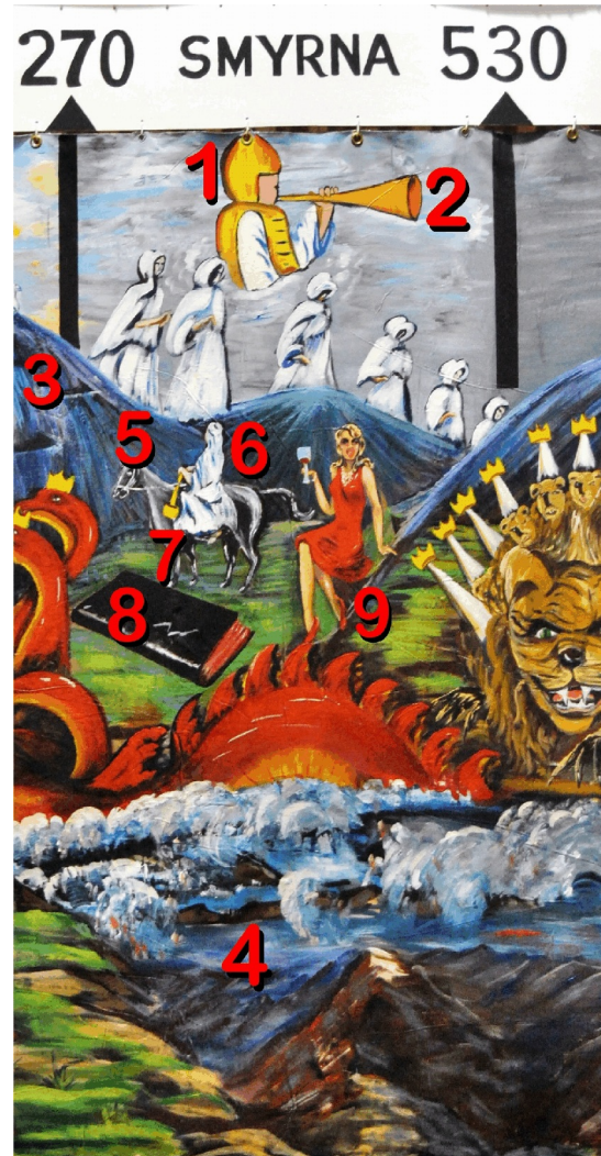
Reference Text: Revelation 2:8-11