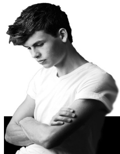
Take Bitterness & Hurt Feelings to God