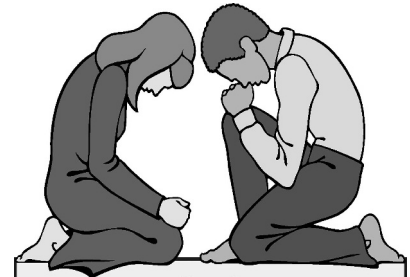
Humbleness & Tears

"In the Old Testament, the New is hidden; in the New Testament, the Old lies open."